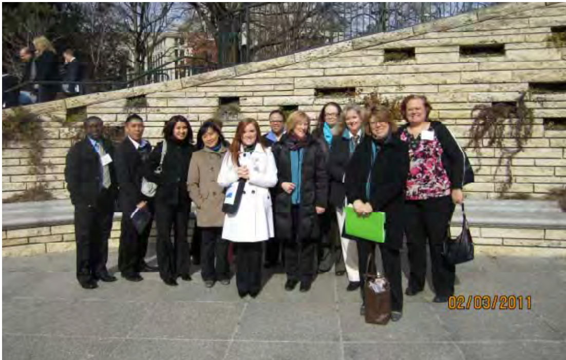
VHIMA Hill Day attendees gathered for a brief moment before entering the Capitol Building in Richmond, VA.

Mark your calendars now for the Fourth VHIMA Hill Day for 2012. We hope you will make plans to join us on. You don't want to miss this event!